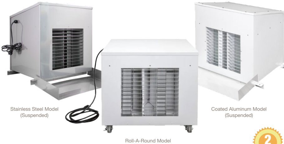
Stainless Steel Model (Suspended)