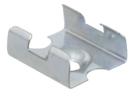
Surface Mount Clip