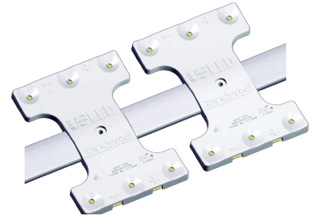
2 Modules / Foot