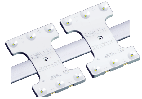
2 Modules / Foot

T2 SERIES Double Sided LED Cabinet Lighting