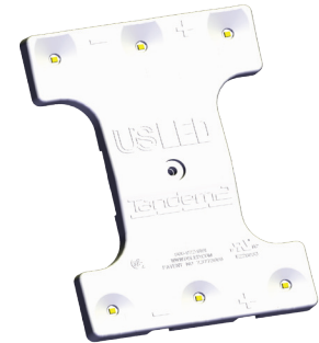
2 Modules / Foot